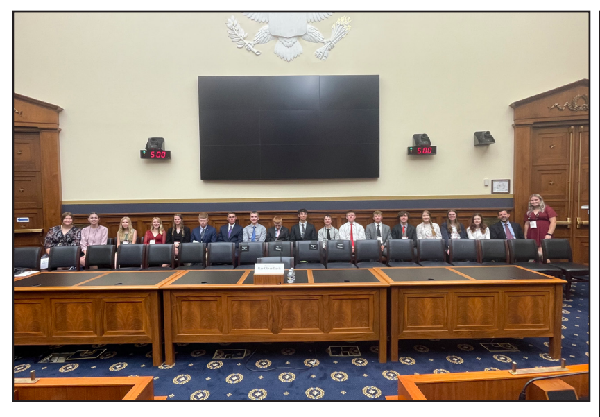
Washington, D.C., Nebraska Youth Tour Delegates at the Capital.