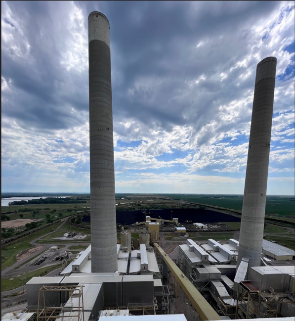
The view from the top of the east building at the Gerald Gentleman Station.