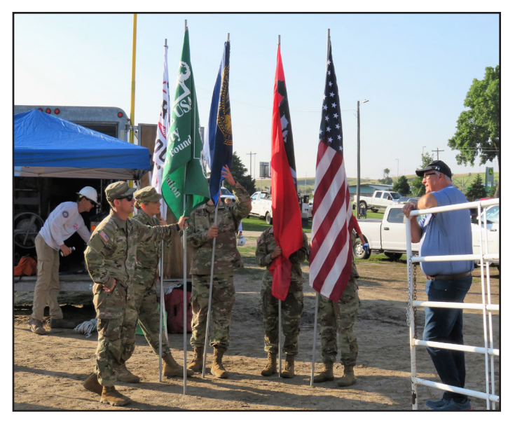
The National Guard 1075th Transport Company waiting to present the Colors.